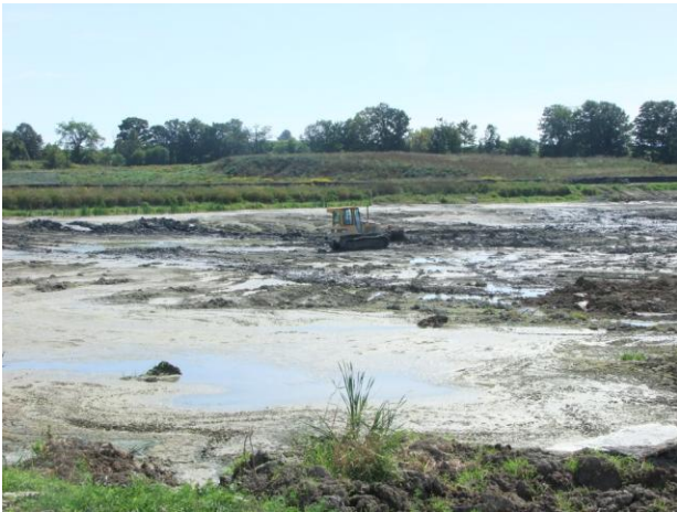
Schomberg sewage lagoons being “naturalized”

overlook of the old lagoons, we found a bulldozer busily shoving muddy soil around to fill in any damp spots.