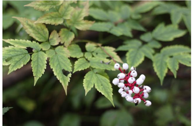
White Baneberry (?)