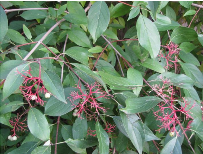
Sept. 22 -- Berries all gone! -- eaten by birds

I planted my Grey Dogwood shrubs along a sunny west-facing fence in sandy soil. I never water them and they thrived even during this summer's drought. After three years they are almost six feet high, quite bushy and a good privacy screen.