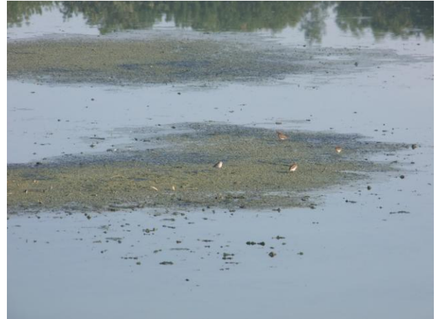
Holland Landing sewage lagoon

hold the water pumped in to allow solids to settle out of it before it is released into the river system.