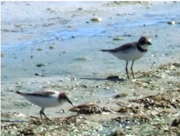
Semi-palmated Sandpiper and Semi-palmated Plover

The prospect of any shorebirds or ducks lingering there seemed remote, but a second visit and a bold drive up to the gate of the sewage treatment plant gave us a chance to look into what was in the middle lagoon. Here again we found the bulldozer moving muck about, but away from its machinations, on tiny bits of damp ground, we found five Killdeers , two Lesser Yellowlegs , two Semi-palmated Plovers and a Semi-palmated Sandpiper .