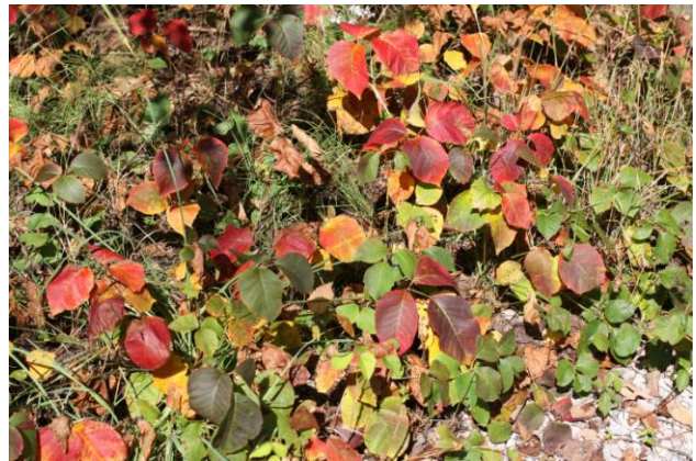
Pretty Poison Ivy!