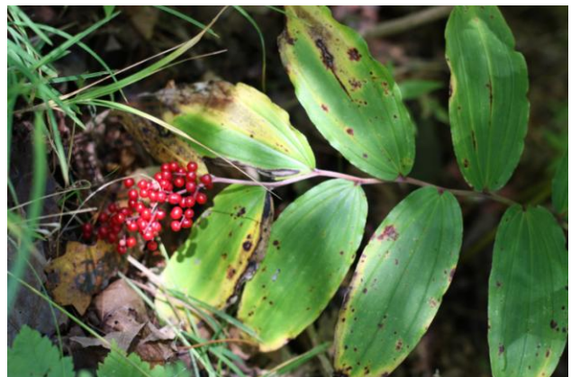
False Solomon's Seal