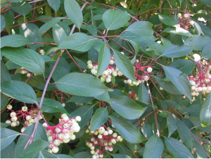
Sept. 18 -- Berries on Grey Dogwood ( C. foemina )